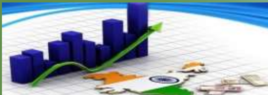
Developmental & Regulatory Role