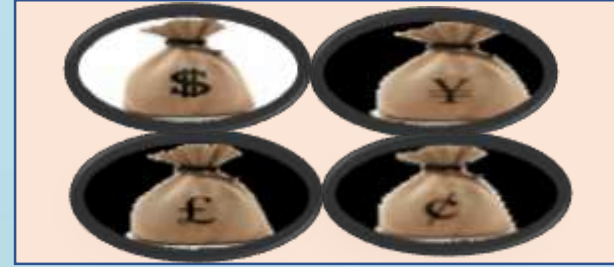
Manager of foreign exchange