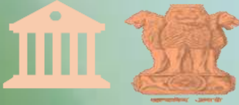
Banker to Government