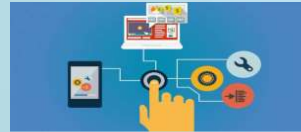
Overseeing Payment Systems