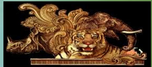
Issuer of Currency