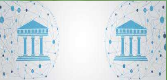
Supervisor of Financial system